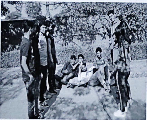
Figure 1 Nukkad Natak on Nashe se Aafat, 14 December, 2019